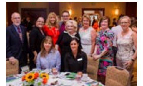
Foundation and Hall staff attended the luncheon award ceremony.