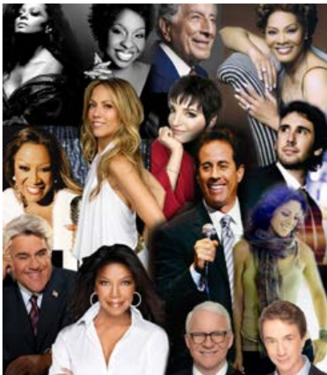
Some of the Van Wezel Foundation's past gala stars

This year marks a very special milestone for the Van Wezel Foundation – 30 Years!