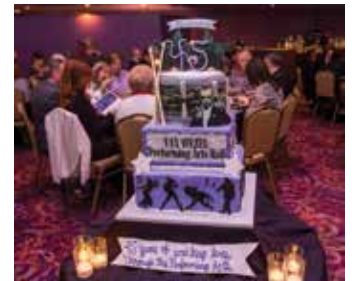
45th Anniversary Cake featuring Ringo Starr

This exclusive evening featured a cocktail reception by the bay, live and silent auction, dinner catered by Mattison's Bayside, and a spectacular performance by Ringo Starr & His All Starr Band.