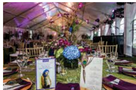
Tent Decor by Mary Kenealy Events