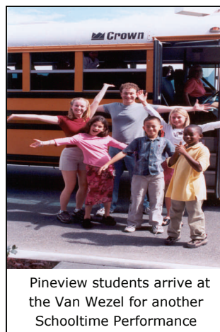
Pineview students arrive at the Van Wezel for another Schooltime Performance

The Van Wezel Education Department has had a long and meaningful history of providing integrative arts education in the public schools in Sarasota, Manatee, Charlotte and Desoto Counties. This program has received national recognition and has established a long term partnership and working relationship with the Kennedy Center. Through that relationship both organizations have been able to take advantage of each other's expertise and experience in the area of integrative arts education.